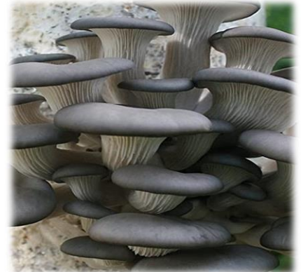
Oysters not ready to harvest, their edges are still curled under