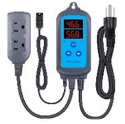
Hygrometer that regulates power to a humidifier