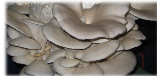
Ready to harvest, edges have flattened out