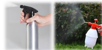
2 types of spray bottles, both work great!