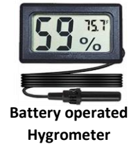
Battery operated Hygrometer

Blue Oyster mushrooms also need oxygen; they absorb oxygen and emit CO 2 . Make sure the kit is not placed in an area with limited oxygen or sealed in a tote or it will not be able to grow.