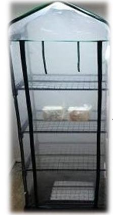
Small indoor greenhouse being used as a fruiting chamber instead of a tote