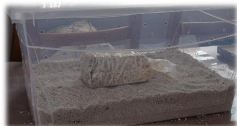
Mushroom kit on top of perlite inside a tote

*A humidifier or fogger can also be used but you must make sure to monitor